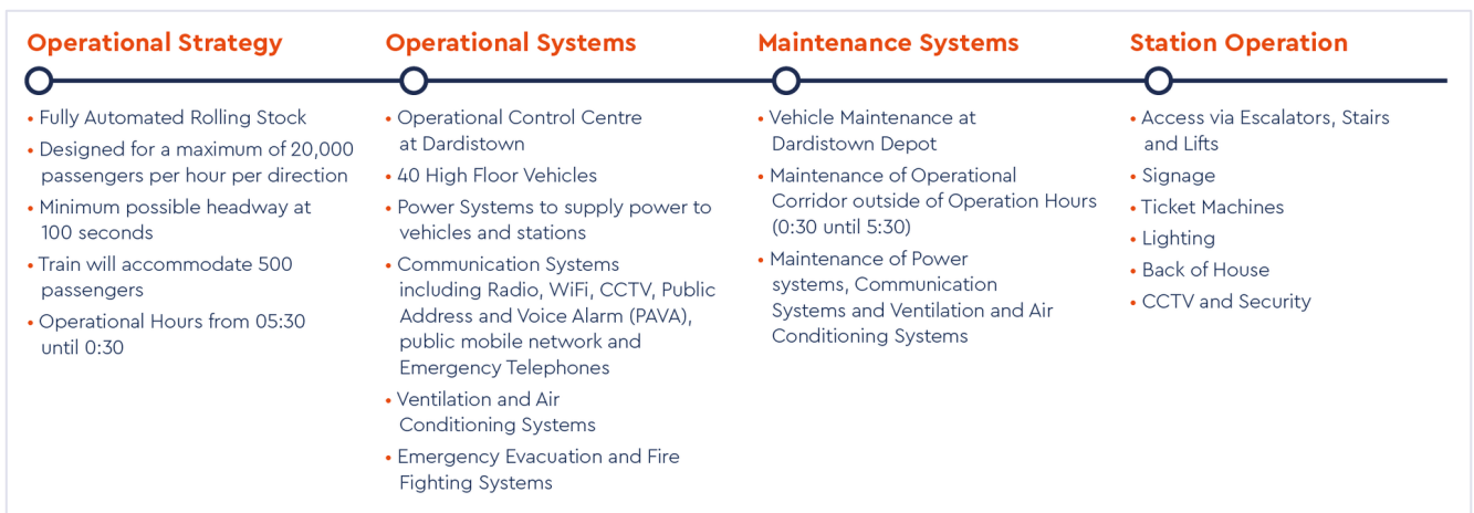
Diagram 31.2: Summary of Key Activities during the Operation Phase of the Proposed Project